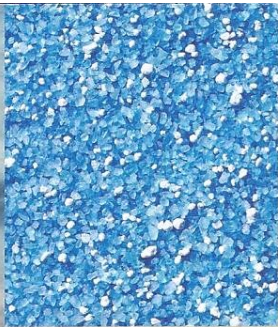
OCEAN BLUE COLOR